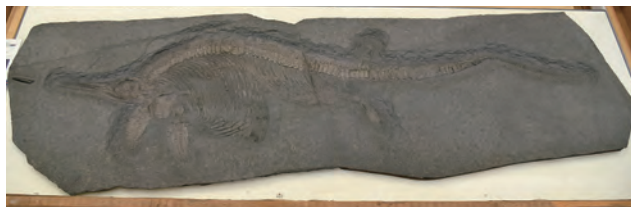
FIGURE 7. Stenopterygius sp., FPDM-V9697.