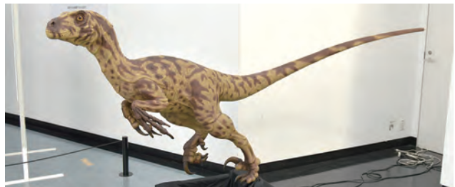
FIGURE 16. Life restoration of Deinonychus antirrhopus by Stephen A. Czerkas, FPDM-O204-1.