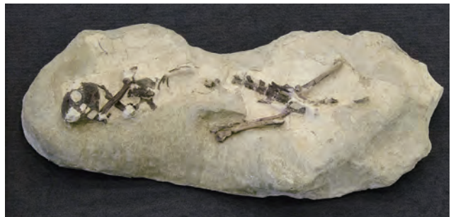
FIGURE 30. Smilodectes gracilis , FPDM-V9713.