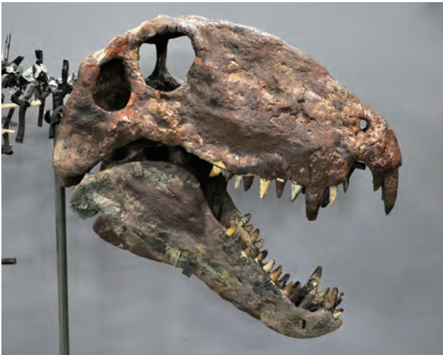
FIGURE 25. Skull of Dimetrodon limbatus , FPDM-V9671.