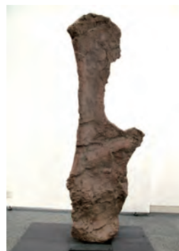
FIGURE 22. Sucapulocoracoid of Supersaurus sp., FPDM-V9707 (cast).