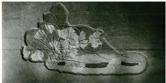
FIGURE 31. Seirocrinus subangularis , FPDM-I195.