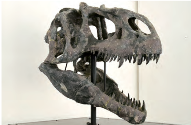
FIGURE 11. Skull of Allosaurus fragilis , FPDM-V9672.