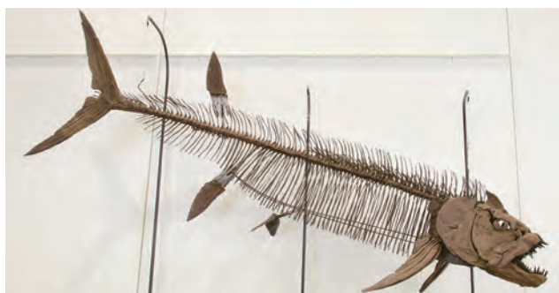
FIGURE 4. Mounted skeleton of Xiphactinus sp., FPDM-V9694 (cast)