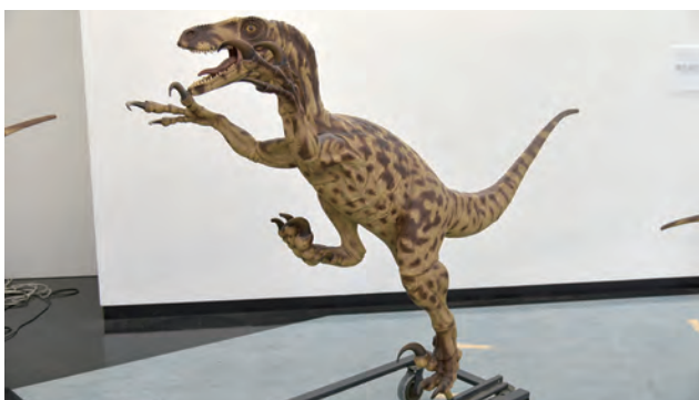
FIGURE 18. Life restoration of Deinonychus antirrhopus by Stephen A. Czerkas, FPDM-O204-3.