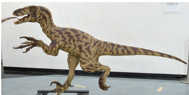
FIGURE 17. Life restoration of Deinonychus antirrhopus by Stephen A. Czerkas, FPDM-O204-2.