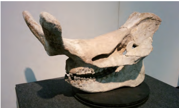
FIGURE 27. Skull of Megacerops platyceras , FPDM-V9710.