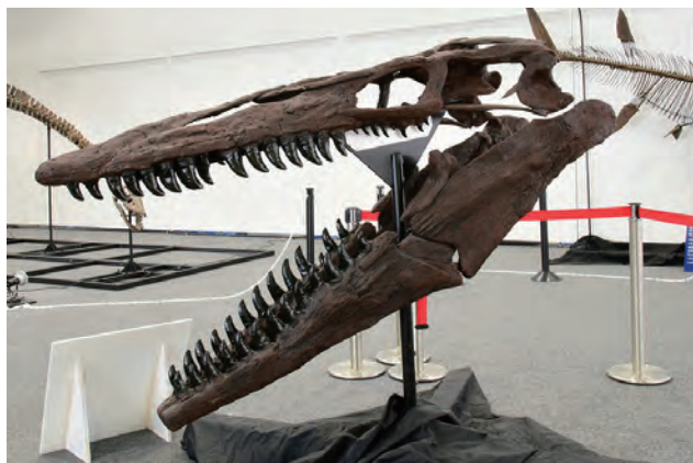
FIGURE 6. Skull of Tylosaurus proriger , FPDM-V9696 (cast).