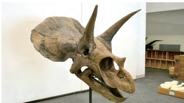
FIGURE 23. Skull of Triceratops sp., FPDM-V9677.