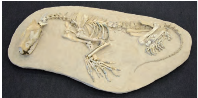
FIGURE 28. Hyaenodon cruentus , FPDM-V9711.