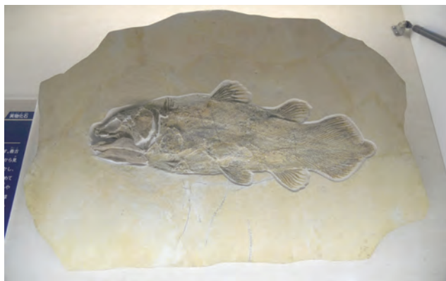
FIGURE 3. Latimeriid coelacanth, FPDM-V9692.