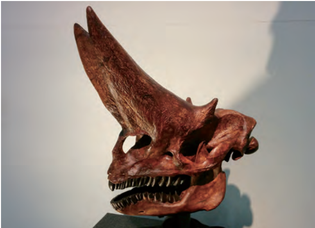
FIGURE 26. Skull of Arsinoitherium zitteli , FPDM-V9709 (cast).