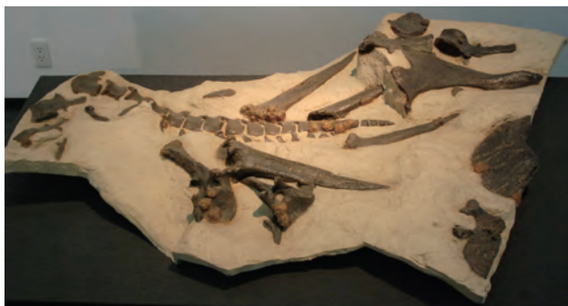
FIGURE 21. Mode of occurrence of Hesperosaurus (cast of FPDM-V9674).