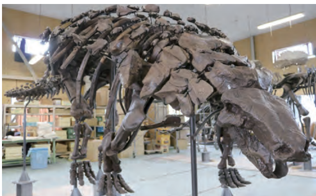
FIGURE 19. Mounted skeleton of Edmontonia sp., FPDM-V9673.