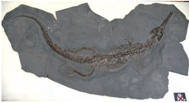
FIGURE 9. Steosaurus bollensis , FPDM-V9699.