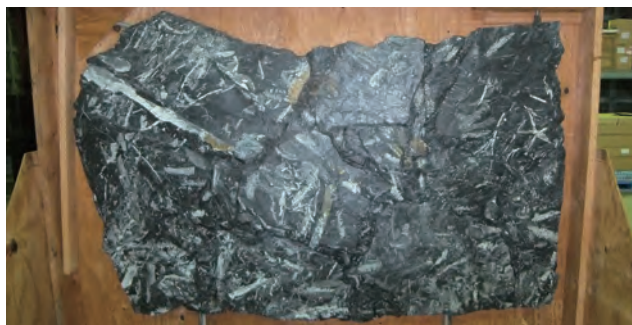
FIGURE 1. "Plate of Paleozoic plants", FPDM-P1402, includes genera Alethopteris , Lepidostrobus , Neuropteris and Pecopteris .