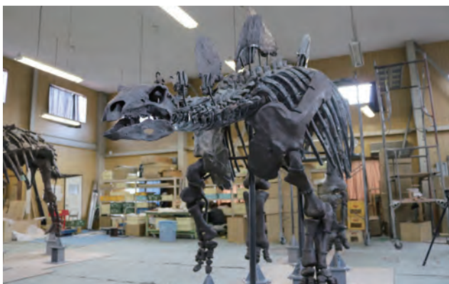
FIGURE 20. Mounted skeleton of Hesperosaurus mjosi , FPDM-V9674.