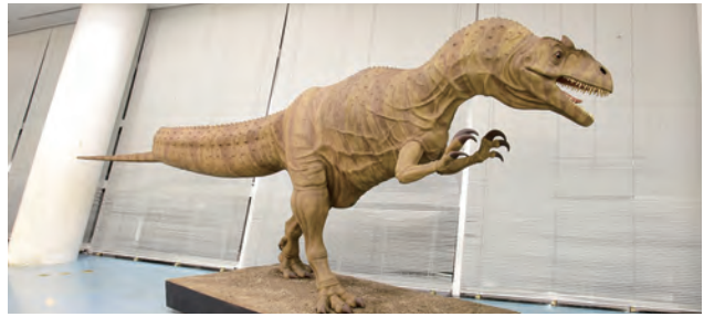
FIGURE 13. Life restoration of Allosaurus fragilis by Stephen A. Czerkas, FPDM-O203.