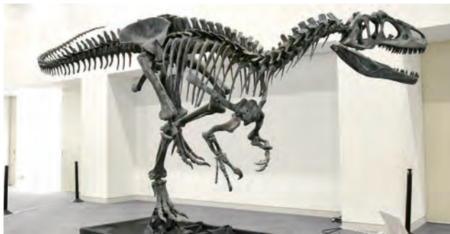
FIGURE 12. Mounted skeleton of Allosaurus fragilis , FPDM-V9701 (cast).