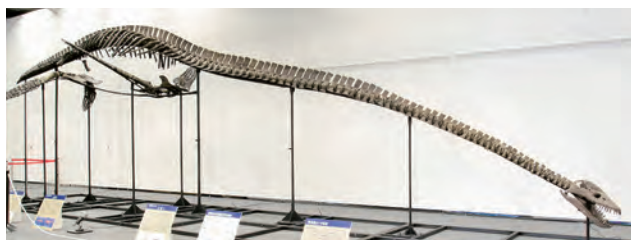
FIGURE 8. Mounted skeleton of Elasmosaurid plesiosaur, FPDM-V9698.