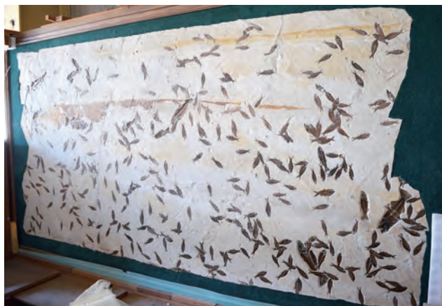
FIGURE 5. "Plate of Freshwater fishes", FPDM-V9695, includes approximately 400 individuals of genera Diplomystus , Knightia and Mioplosus .