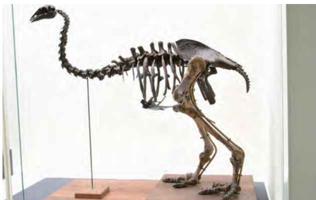
FIGURE 24. Mounted skeleton of Dinornithid bird, FPDM-V9708.