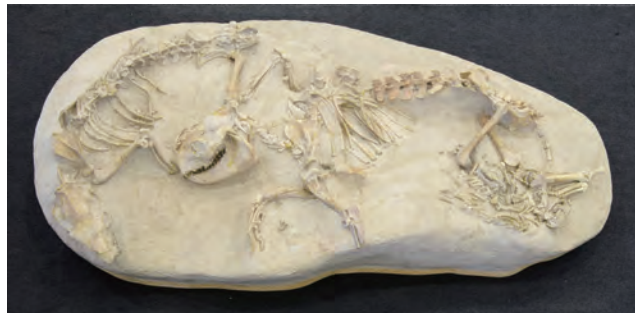
FIGURE 29. Merycoiododon gracilis , FPDM-V9712.