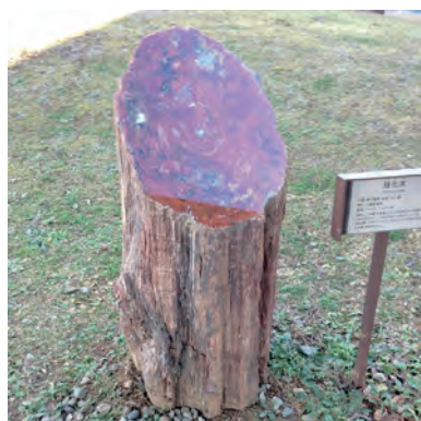
FIGURE 2. Araucarioxylon arizonicum , FPDM-P1403.