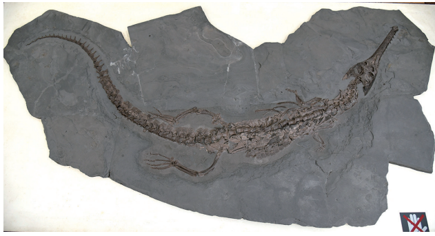
FIGURE 9. Steneosaurus bollensis , FPDM-V9699.