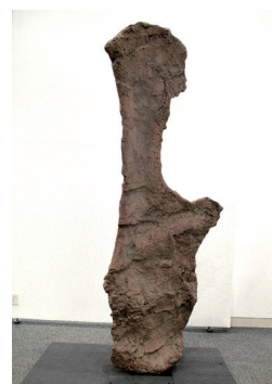
FIGURE 22. Supaculocoracoid of Supersaurus sp., FPDM-V9707 (cast).