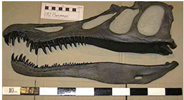
FIGURE 14. Skull of Baryonyx walkeri , FPDM-V9702 (cast).