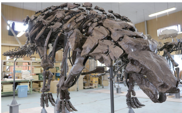
FIGURE 19. Mounted skeleton of Edmontonia sp., FPDM-V9673.