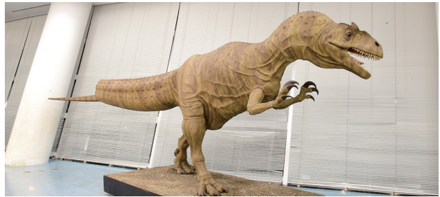
FIGURE 13. Life restoration of Allosaurus fragilis by Stephen A. Czerkas, FPDM-O203.