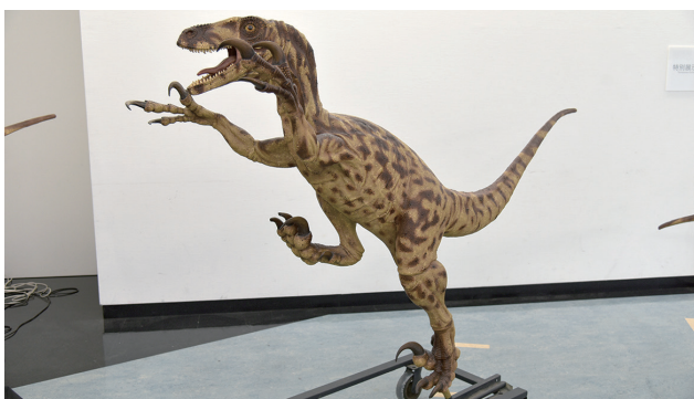
FIGURE 18. Life restoration of Deinonychus antirrhopus by Stephen A. Czerkas, FPDM-O204-3.