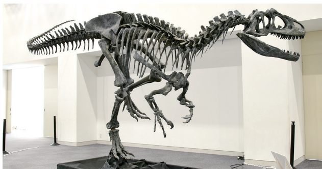
FIGURE 12. Mounted skeleton of Allosaurus fragilis , FPDM-V9701 (cast).