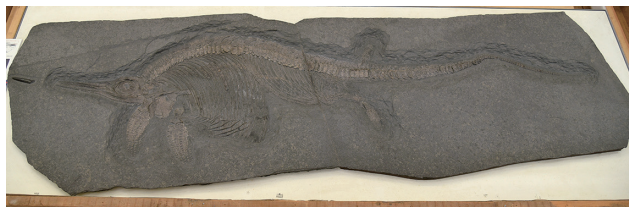
FIGURE 7. Stenepterygius sp., FPDM-V9697.