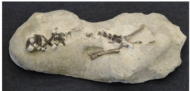
FIGURE 30. Smilodectes gracilis , FPDM-V9713.