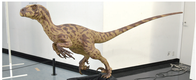
FIGURE 16. Life restoration of Deinonychus antirrhopus by Stephen A. Czerkas, FPDM-O204-1.