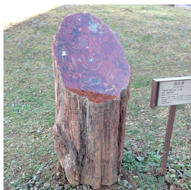
FIGURE 2. Araucarioxylon arizonicum , FPDM-P1403.