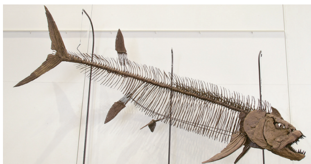
FIGURE 4. Mounted skeleton of Xiphactinus sp., FPDM-V9694 (cast)