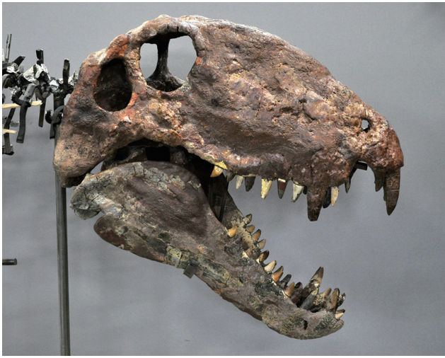
FIGURE 25. Skull of Dimetrodon limbatus , FPDM-V9671.