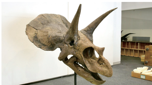
FIGURE 23. Skull of Triceratops sp., FPDM-V9677.