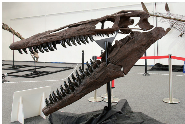
FIGURE 6. Skull of Tylosaurus proriger , FPDM-V9696 (cast).