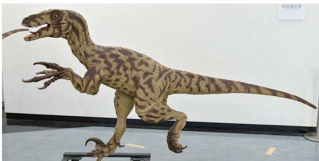
FIGURE 17. Life restoration of Deinonychus antirrhopus by Stephen A. Czerkas, FPDM-O204-2.