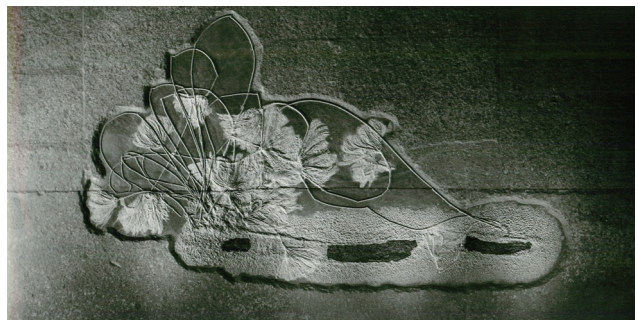
FIGURE 31. Seirocrinus subangularis , FPDM-I195.