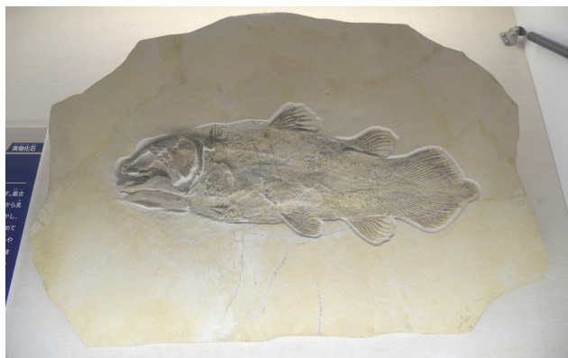
FIGURE 3. Latimeriid coelacanth, FPDM-V9692.