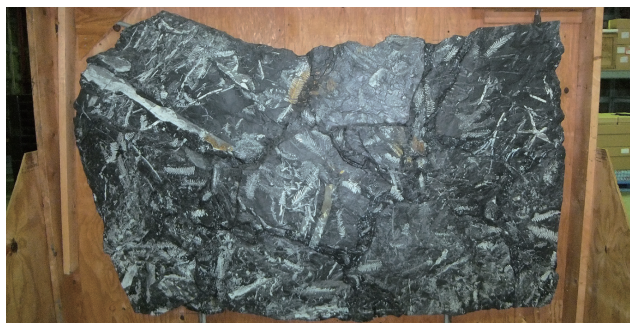
FIGURE 1. "Plate of Paleozoic plants", FPDM-P1402, includes genera Alethopteris , Lepidostrobus , Neuropteris and Pecopteris .