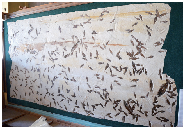
FIGURE 5. "Plate of Freshwater fishes", FPDM-V9695, includes approximately 400 individuals of genera Diplomystus , Knightia and Mioplosus .