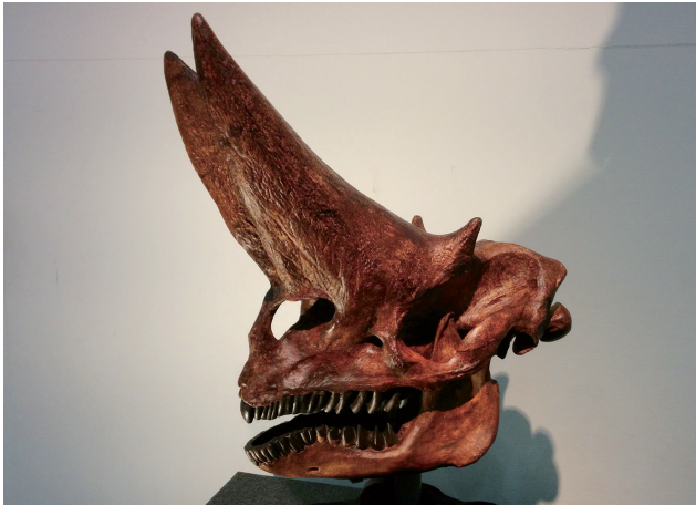
FIGURE 26. Skull of Arsinoitherium zitteli , FPDM-V9709 (cast).