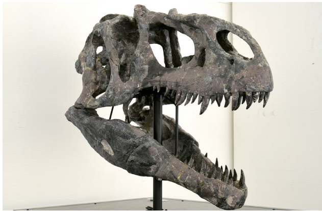
FIGURE 11. Skull of Allosaurus fragilis , FPDM-V9672.