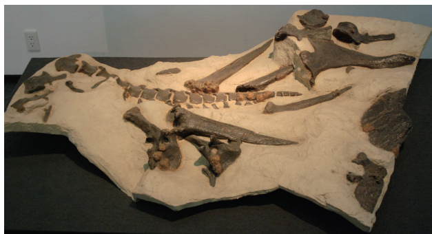
FIGURE 21. Mode of occurrence of Hesperosaurus (cast of FPDM-V9674).