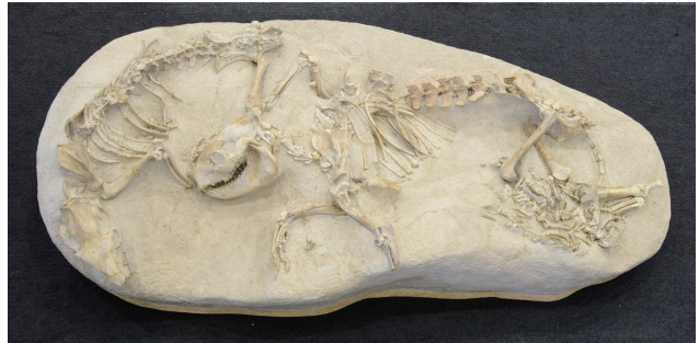
FIGURE 29. Merycoidodon gracilis , FPDM-V9712.