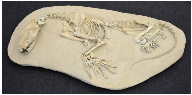
FIGURE 28. Hyainodon cruentus , FPDM-V9711.