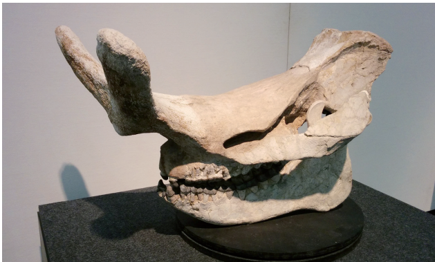
FIGURE 27. Skull of Megacerops platyceras , FPDM-V9710.