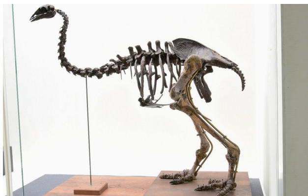
FIGURE 24. Mounted skeleton of Dinornithid bird, FPDM-V9708.