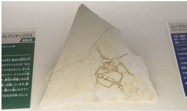
FIGURE 10. Pterodactylus antiquus , FPDM-V9700.