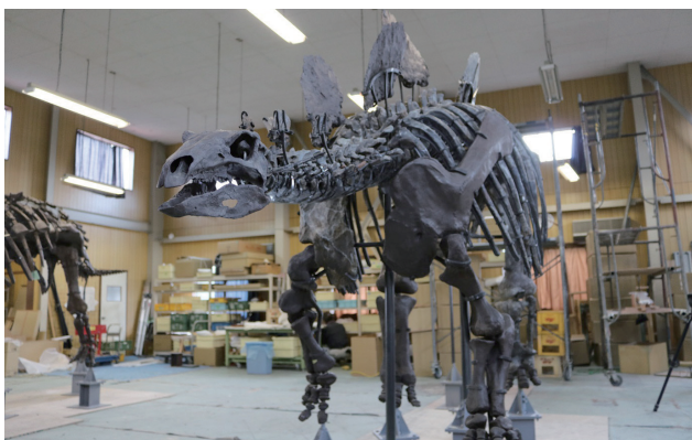
FIGURE 20. Mounted skeleton of Hesperosaurus mjosi , FPDM-V9674.